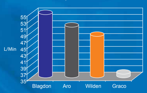
1/2" Metallic Pump Flowrate @ 7Bar Air Inlet (L/Min)

Independent 3rd Party testing by Sunderland University took a selection of manufacturers pumps on a like for like basis. Blagdon was shown to have the best flowrate on the market as the illustration shows. This enables the transfer of fluid to be quicker, therefore reducing the production process costs.