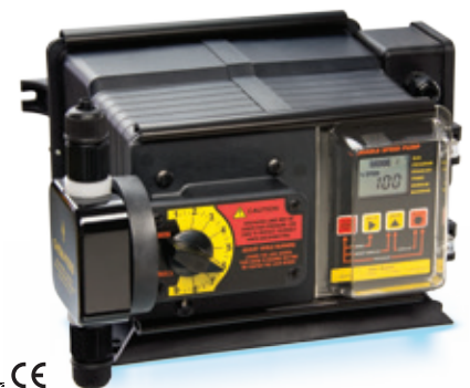
DIGITAL V MODEL - VARIABLE SPEED UNIT with Stroke Length & 4-20mA, 0-10Vdc, and Pulse Input Speed Control