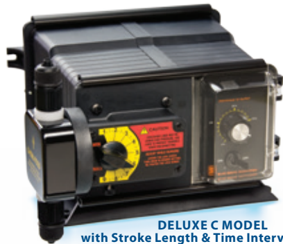
DELUXE C MODEL with Stroke Length & Time Interval Control