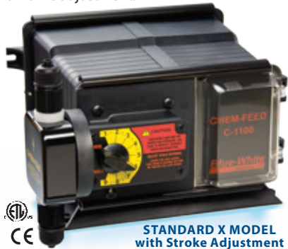
STANDARD X MODEL with Stroke Adjustment

DIGITAL E MODELS feature stroke length, electronic user programmable time interval (interval lengths from 0.1 through 199.9 sec, min, hrs or days are user programmable), and external input signal batch control. The unit accepts pulse inputs (programmable from 0.1 - 199.9 sec, min, hrs or days) which can trigger programmable timed chemical injection batches from 0.1 - 199.9 sec, min, hrs or days in duration. Analog signals can be used to remotely vary the interval timer's on-time adjustment.