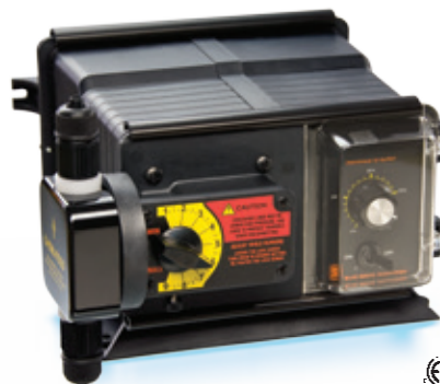
DELUXE F MODEL - VARIABLE SPEED UNIT with Stroke Length & Analog Speed Control