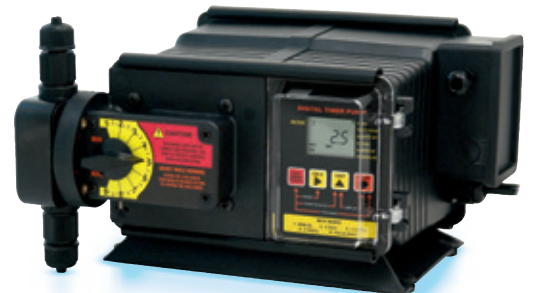
DIGITAL E MODEL with Stroke Length & Time Interval Control